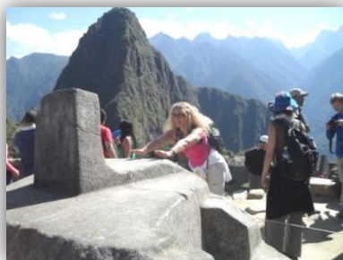
Machu Picchu – hitching post of the sun

We consider ourselves to be pilgrims rather than tourists when we connect by meditation, inner stillness and ceremonies with the real power of the “crystalline city” which is physically remote from our normal civilization. In our first ceremony we ask permission from the beings of the most sacred of all known Inca-cities, the puma, the condor and the light of the spirits of the place, to visit this city. Tour of the 7 places of power. The whole complex is an electromagnetic focal point. Each invocation and each prayer is greatly enhanced. Overnight at Hotel Taypikala in Aguas Calientes.