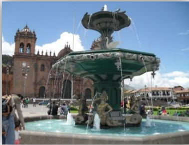
Cusco – Plaza de Armas

We are transferred to the airport and take a morning flight to Cusco . Check in at the Hotel Taypikala; time to “arrive” and adapt to the altitude (3,400 m; ca. 10,200 ft); in the afternoon you have the chance to walk around historic Cusco, to experience the ley-lines, the intensity of which is similar to those of the sacred cities of Benares, Jerusalem, Mekka, Assisi and other sacred places. In Quechua, Cusco means “navel” of the (Inca-) world, and it was the center of the Inca-empire. The city itself is designed in the shape of a puma, who represents the here and now. Overnight at Hotel Taypikala, Cusco.