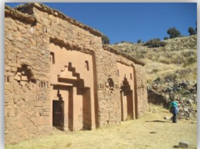
Temple / moon island

We are going by boat to the northern part of the Island of the Sun and hike to Roca Sagrado , the sacred rock of the puma. Boat ride to Isla de la Luna , Island of the Moon, and the Temple of the Female. In 2000 scientists discovered on the floor of Lake Titicaca – near Copacabana, Sun and Moon Island – ruins of ancient structures, which were identified as temples, terraces, a pre-Inca road and an approx. 800 m (ca. 2,400 ft) wall. After our visit to the temple on Moon Island we take the boat back to Copacabana . Visit of the Cathedral of Copacabana. Overnight at Hotel in Copacabana (more details to follow).